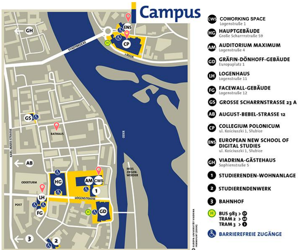
Campus Map European University Frankfurt (Oder)